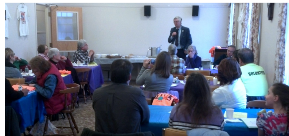
CROP Walk Recruiters' Workshop—Tuesday, March 24 At Emmanuel Friedens

CROP ( C ommunities R esponding To O vercome P overty) Walk—Sponsored by Schenectady Inner City Ministry (SICM) and Church World Services: The annual CROP Walk has consistently been in the top 25 in the country, thanks to many supporters from our area. This year's walk will be held on Sunday, May 3, rain or shine. The 5K walk begins and ends at Emmanuel Friedens. Registration begins at 12:30 pm and the walk kicks-off at 1:30 pm. It is a day of celebration and community building as we walk to raise money for hunger-fighting efforts in Schenectady and around the world. A full 25% of the money raised remains in our local community and is distributed to food pantries, the Community Crisis Network Center and Senior Meals (Catholic Charities).